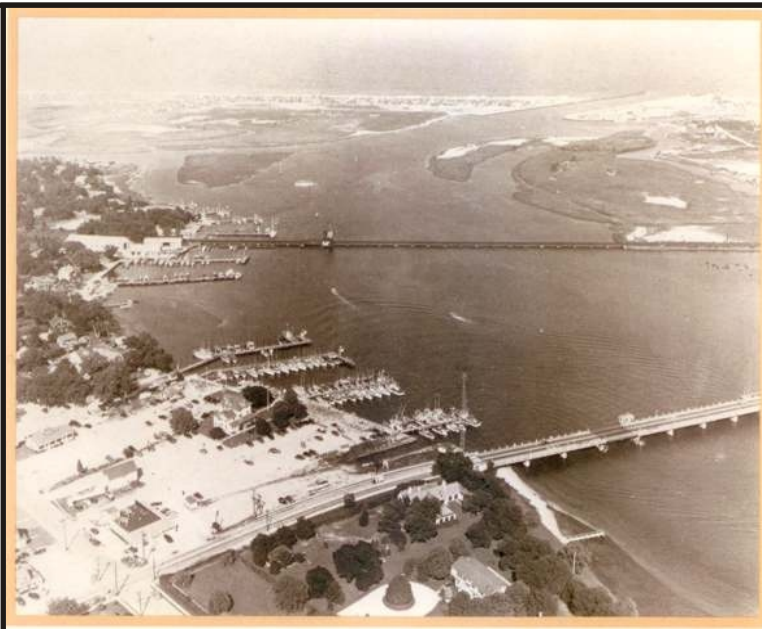
Aerial view circa 1938. Note the Rt. 35 low level bridge at the end of Higgins Avenue.

All of us have seen the heavy traffic over today's Route 35 bridge, especially on summer weekends. Imagine all that traffic going down Higgins Avenue! Thankfully the State officials were forward thinking enough to spare us the problem!